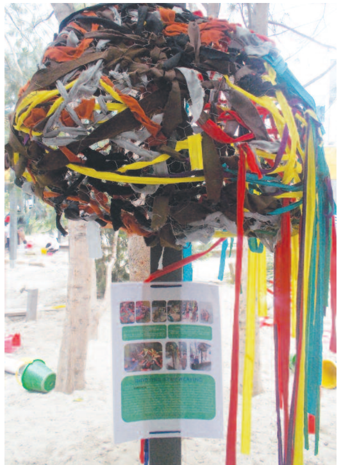
An interest in space led to the creation of a shooting star using chicken wire and ribbon