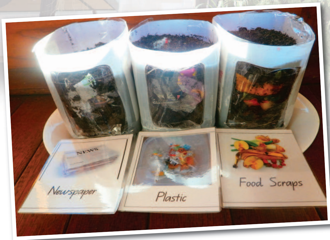
Organic vs non-organic breakdown experiment