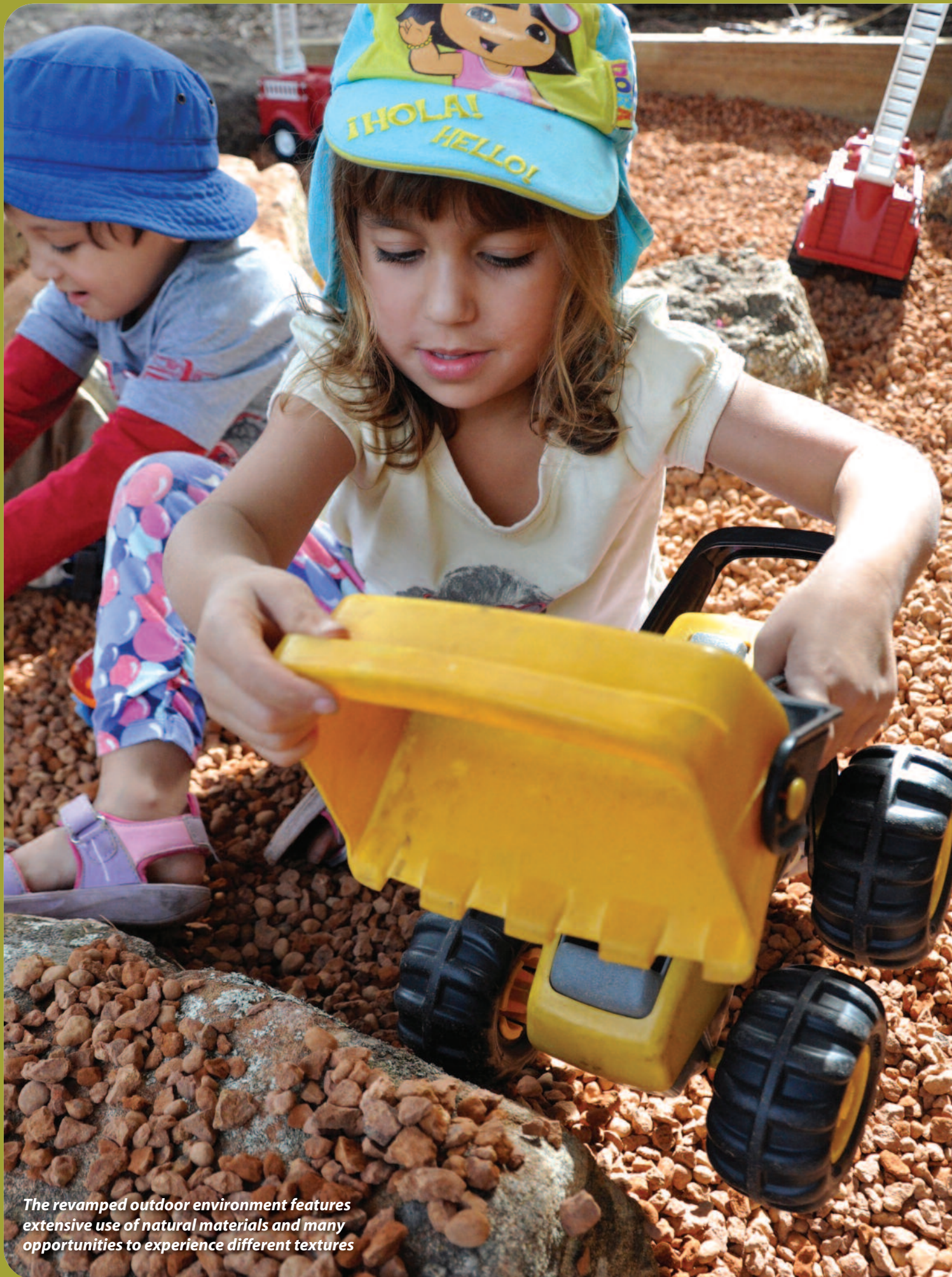
The revamped outdoor environment features extensive use of natural materials and many opportunities to experience different textures